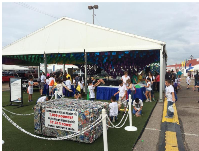
A classroom of kids stop by the NSF Sustainability Pavilion to make a recycled plastic bag parachute during the 2016 State Fair

The 2017 Fair is August 25 through September 4. The Sustainability Pavilion is a great place to reach out to State Fair guests with an activity, a "make & take" project, a demonstration, or a presentation. The Sustainability Pavilion is focused on sharing with and encouraging the public to make better environmental choices.